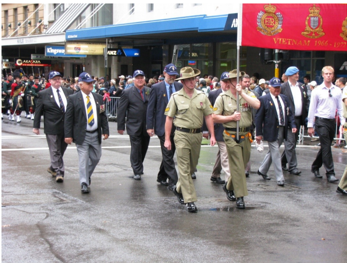
17 Construction Squadron Workshop Vietnam Association on parade at the 2011 Sydney ANZAC Day march.

Most of the members attending the cruise were there and enjoyed themselves immensely. The night continued until late with many members coming together for the first time since the Darwin reunion. The first day of any reunion is always a great function and this was no exception. Once in the swing of things people got going and the evening went so quickly. Although the function was scheduled to take place between 1800 hours to 2000 hours, members stayed until after midnight.