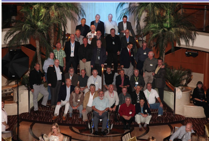
The Male members