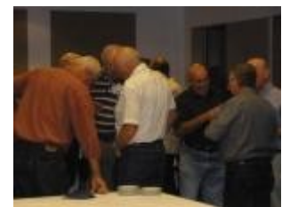
Meet & Greet at the Hyde Park Inn - Thursday 28th

On Friday the 29th we were ferried by bus from the Hyde Park Inn to the P & O ship The Pacific Jewel . After a very quick check in - the members gathered around the decks and began the cruise formalities with a drink or two.