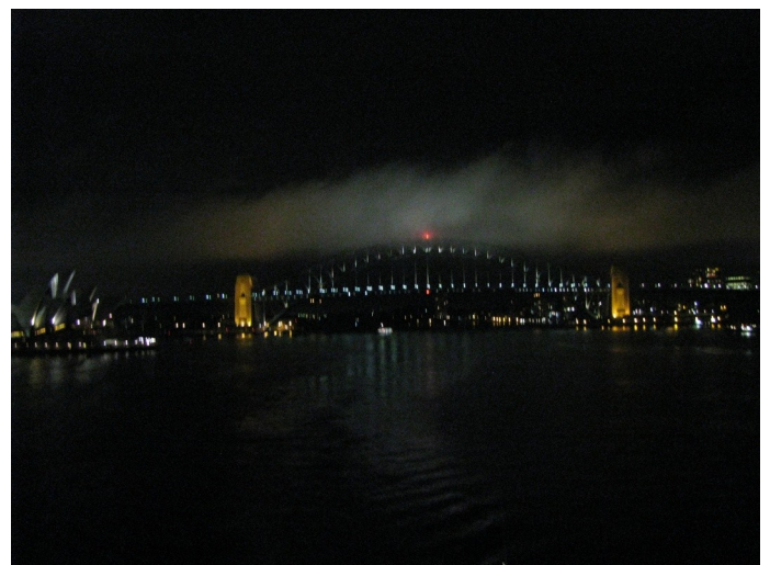
The Harbour Bridge at night - from the deck of the ship