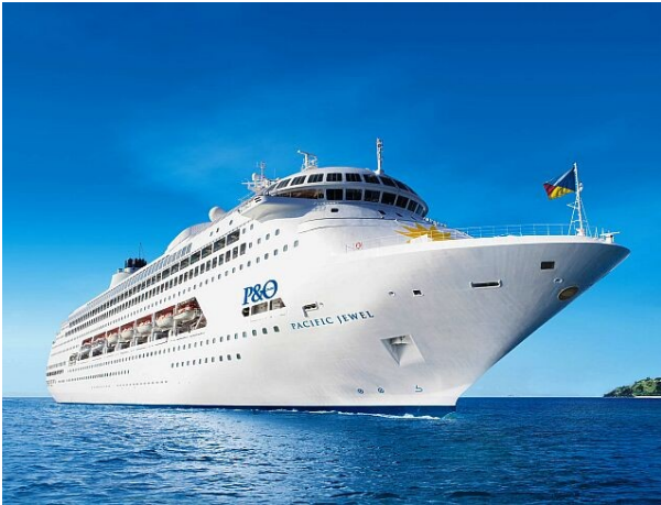
The P & O Ship The Pacific Jewel