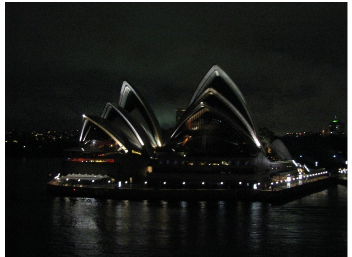
The Opera House at night - from the deck of the ship