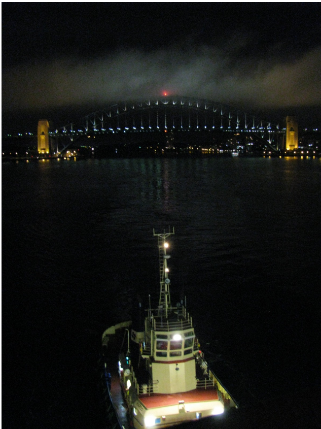
A tug boat guiding the Pacific Jewel out of the harbour

The tug boat and a Manly ferry followed us until we got to the heads and then we were on our own.