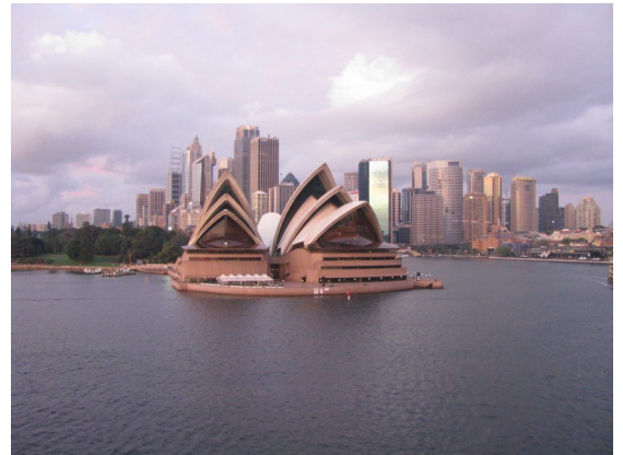
Below - The Sydney Opera House as we re-entered the harbour