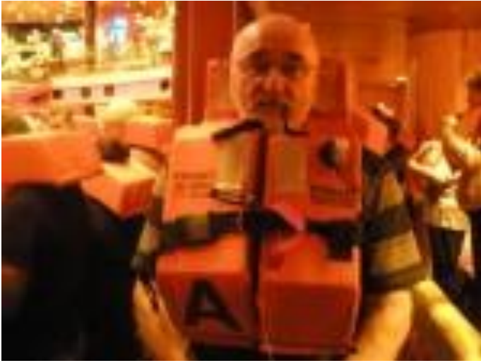
Wow, that's a life vest ???

W ith the cruise now underway we had a life boat drill to ensure that we would be safe in the event of an emergency.