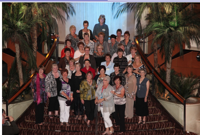
The Female members

All in all the members enjoyed the reunion cruise, unfortunately it had to come to an end. The three days went by very quickly and the feed-back was extremely positive with the general consensus being that it was a another very successful reunion. The two years since the Alice reunion went very quickly and it is now time to begin preparations for the next event. September 2013, mark it in your diary now.