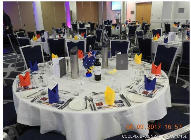
Table set up for the dinner.