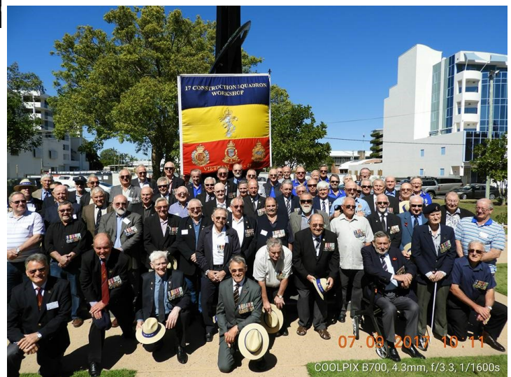
Reunion photo - after the parade and service in Maroochydore.