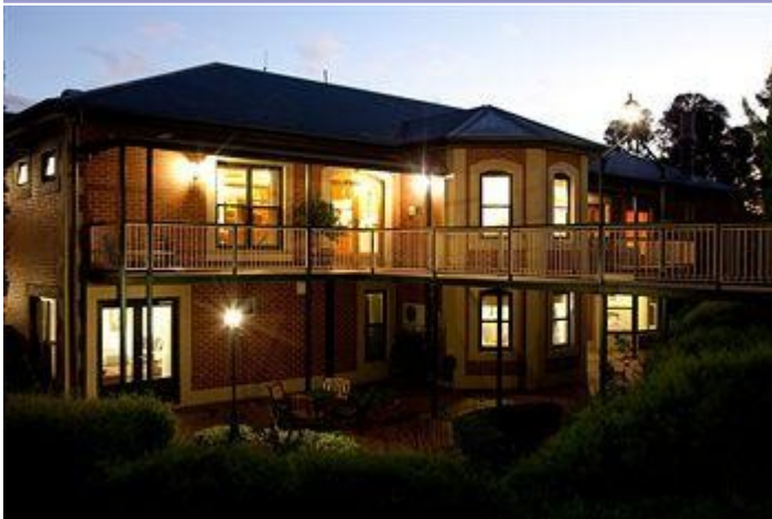
Clare Country Club