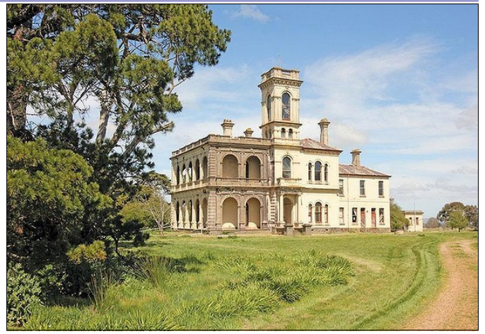
Romsey Mansion - Mintaro