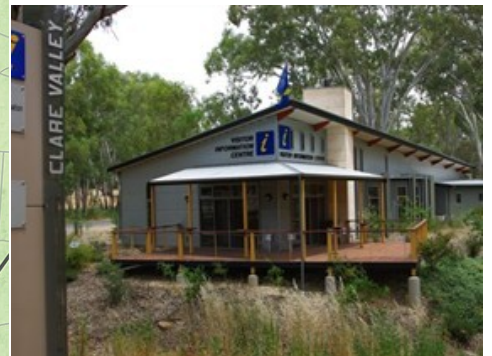
The Clare Information Centre