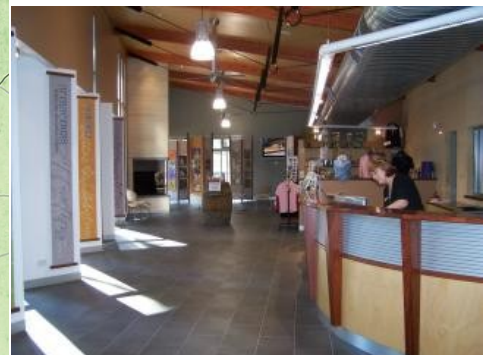
Inside the Information Centre

The Clare Visitor Information Centre is located right next door to the Clare Caravan Park